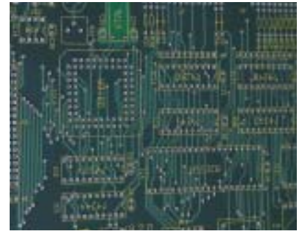
Circuit board design and layout