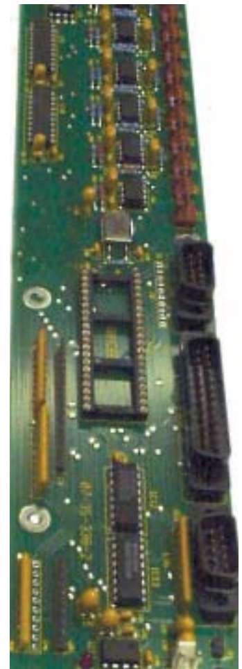
Special-purpose PC Board subassemblies

Pioneer Cable Company offers electronic assembly, custom cables and wiring harnesses as well as full production including metal work, wood and plastic forming and from design through finished customer-ready product and drop shipping.