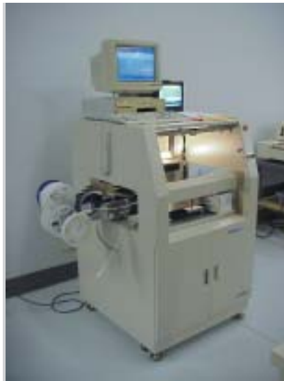
Automated PC Board placement machines - speed and precision